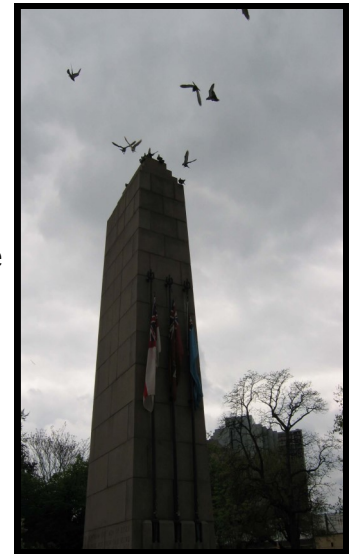
War Memorial at City Hall Square in Windsor