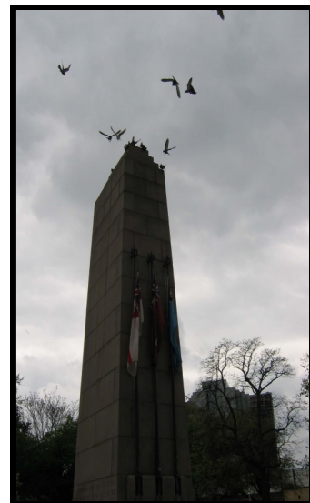
War Memorial at City Hall Square in Windsor