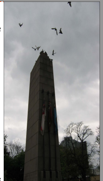
Above: War Memorial at City Hall Square in Windsor.