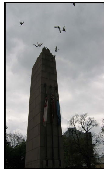
War Memorial at City Hall Square in Windsor

Celebrate. Honour. Remember. Thank. Teach.