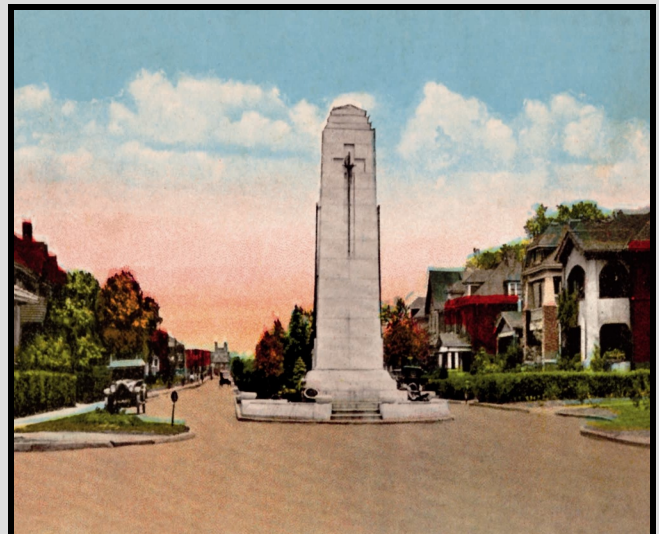
Above: The Cenotaph at its original location on Ouellette Avenue.

This postcard depicts Giles Boulevard at Ouellette Avenue, looking east. The Essex County War Memorial Cenotaph, built in honour of WWI veterans, originally faced Ouellette Avenue. In 1965, the monument was dismantled and reassembled at its present location in City Hall Square.