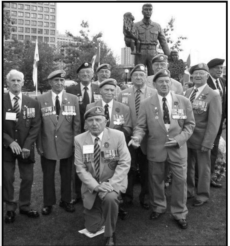
RIGHT: Windsor Veterans at the Unveiling and Dedication of the National Korean War Memorial in Ottawa, Ontario.